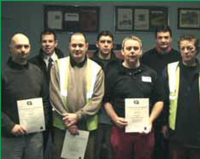
ASF installers with their GQA SVQ Certificates.

A partnership between GQA Approved Centre Glasgow College and Ayrshire Shop Fronts (ASF) has developed in 2004 and came to a successful initial outcome with the recent awarding of nine (9) GQA Fenestration Installation and Surveying Level 2 Scottish Vocational Qualifications (SVQs).