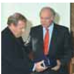
NLTG receiving GTL Award for Training Provider of the Year