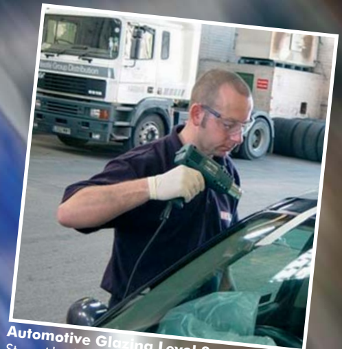
Automotive Glazing Level 3